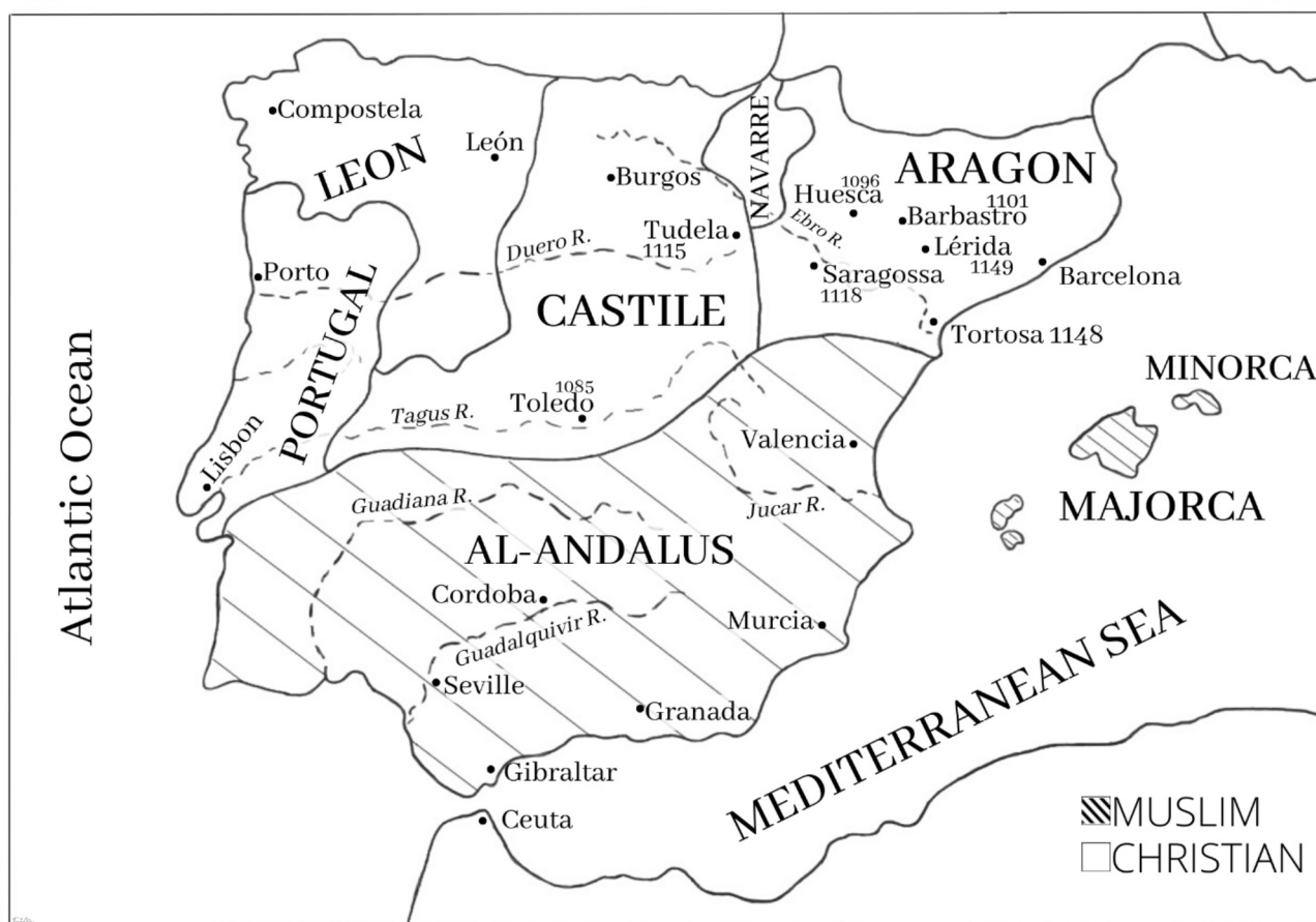
Map 2: Spain 1150, after the first period of reconquest. Year of conquest given for important cities.