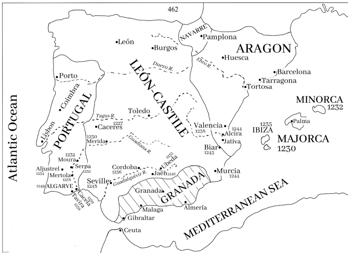
Map 3: Spain 1250, after the second period of reconquest. Year of conquest for some cities, provinces and islands.